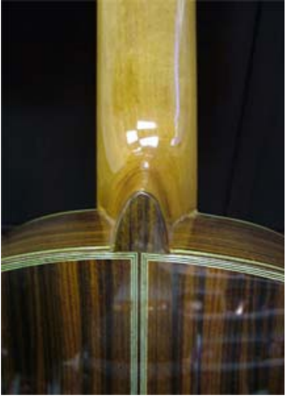
Close-grained cedar is used for the soundboard. Notice how the sides join the neck unevenly at the 12th fret.